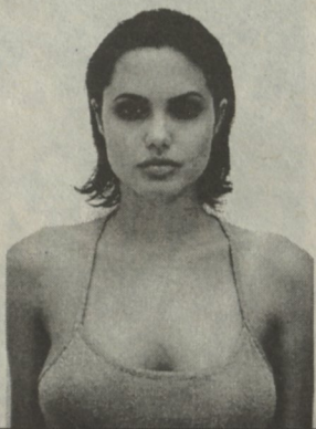
Girl, Interrupted's Angelina Jolie

hospital for a "short rest." There she is forced to choose between the world of people who