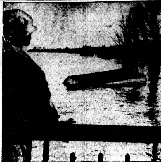
HOUSEBOAT — A home, torn loose by the rampaging flood waters of the Red River, floats downstream, through Winnipeg, Canada. Thousands were fleeing the disaster, with officials warning that "the worst was yet to come."