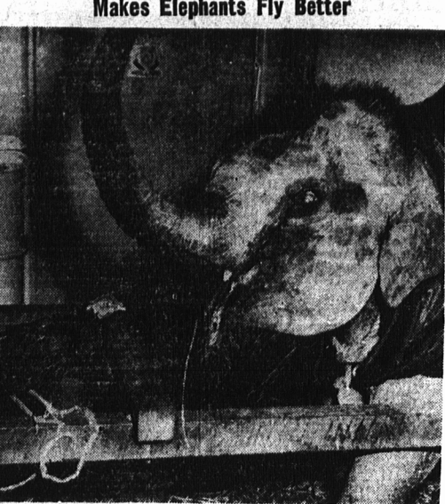
Makes Elephants Fly Better

According to airline crews, elephants fly better when accompanied by a hen. Or rather, they are better air travellers for some reason or other when a chicken is taken along. And by way of