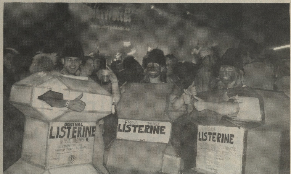
Last time I was into the Listerine I can't remember the night either