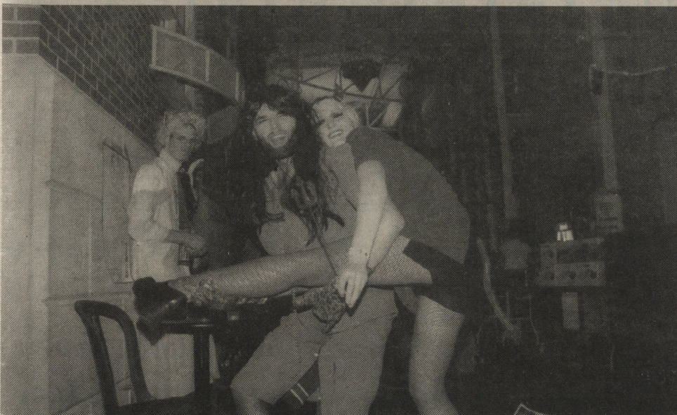
You're not the only one to check to see if she's wearing underwear