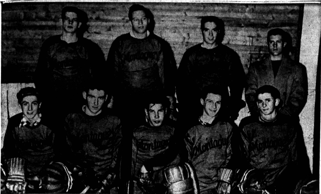
Montague High School Hockey Team