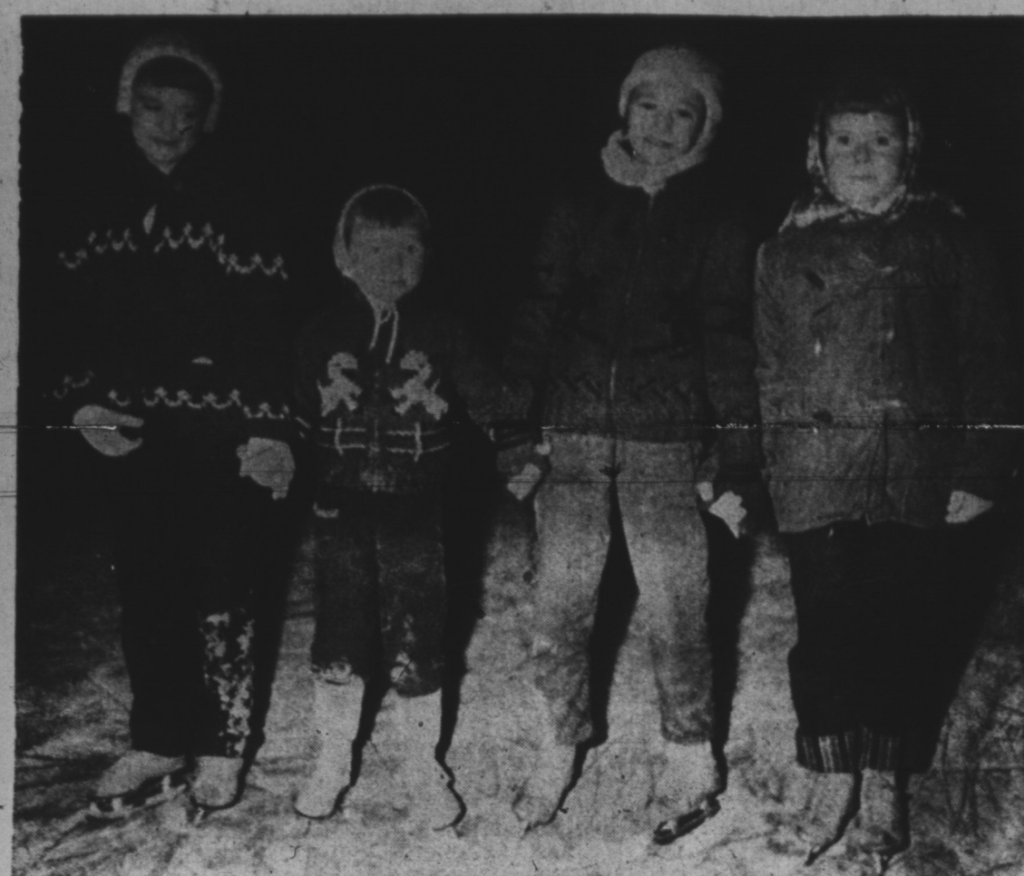
FIRST ADVENTURE ON ICE