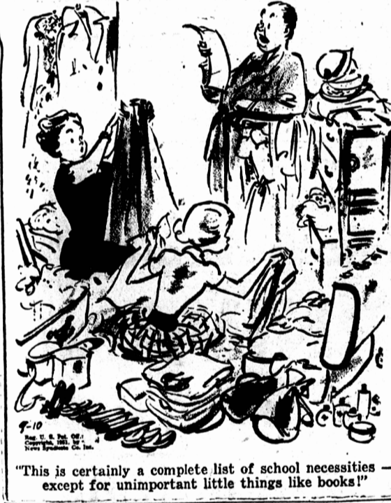
"This is certainly a complete list of school necessities - except for unimportant little things like books!"