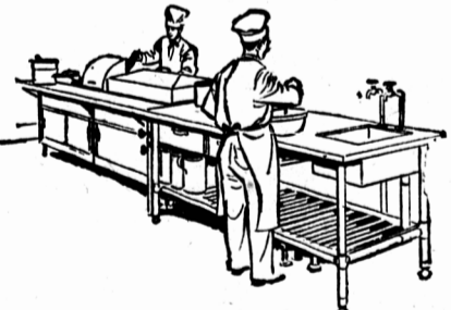
Today important parts of sterilizers and instruments in hospitals are being made of nickel alloys because these alloys provide strength, corrosion resistance, long wear, and a surface that is bright, non-porous and sanitary. For the same reasons, kitchen working surfaces are made of nickel alloys.

Hundreds of everyday uses for Nickel have been developed by the Nickel industry through a planned program of research. Today a large share of Canada's Nickel production is being diverted from peacetime uses into channels for preparedness. So the Nickel mine facilities, greatly expanded over the past decade, are again being operated at peak capacity. There is actually more Nickel now being delivered by Canada to the free world than in any peacetime year.