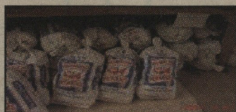
Mass Destruction?...p. 11