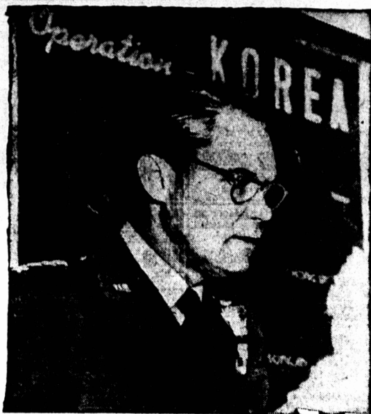
AGAINST A-BOMB IN KOREA

Gen. Hoyt S. Vandenberg, Air Force chief of staff, speaks during a press conference in the Pentagon, Washington, after his return from Korea. Vandenberg said there are no targets in North Korea important enough to warrant use of atomic bombs by U.N. Forces.