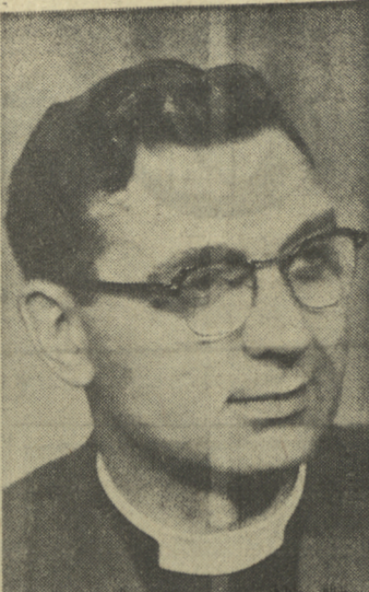
ACTS AT ZION

VANCOUVER (CP)—The Vancouver Province says Premier Bennett told one of its reporters that he will sue the reporter and the newspaper for $1,000,000 because of a Tuesday story on provincial debt reduction. The story, from Victoria, said the premier would transfer a $28,000,000 direct - debt item to the government - owned B.C. Power