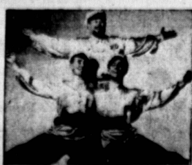
DON COSSACK CHORUS QUEEN CHARLOTTE HIGH SCHOOL - SAT. SEPT. 28