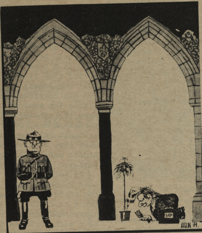
NEWS ITEM: OTTAWA TO EASE UP ON MARIJUANA LAWS.