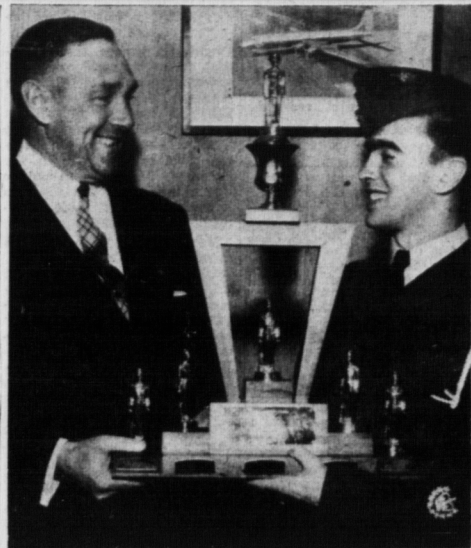
DRILL TROPHY PRESENTED