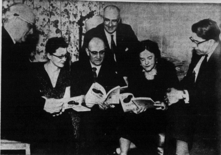
ADJUDICATORS ARRIVE FOR FESTIVAL TODAY