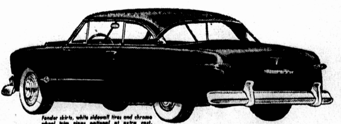
Fender skirts, white sidewall tires and chrome wheel trim rings optional at extra cost.

Here is outstanding beauty of automotive design... to grace any road... the 1951 Meteor Custom Deluxe Victoria Coupe.