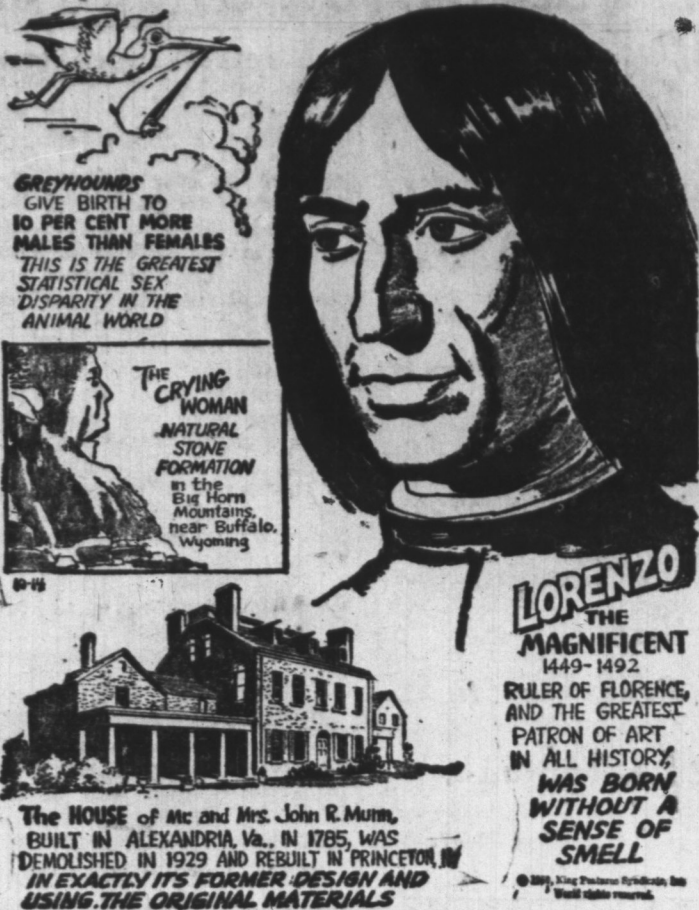
LORENZO THE MAGNIFICENT 1449-1492 RULER OF FLORENCE, AND THE GREATEST PATRON OF ART IN ALL HISTORY WAS BORN WITHOUT A SENSE OF SMELL.