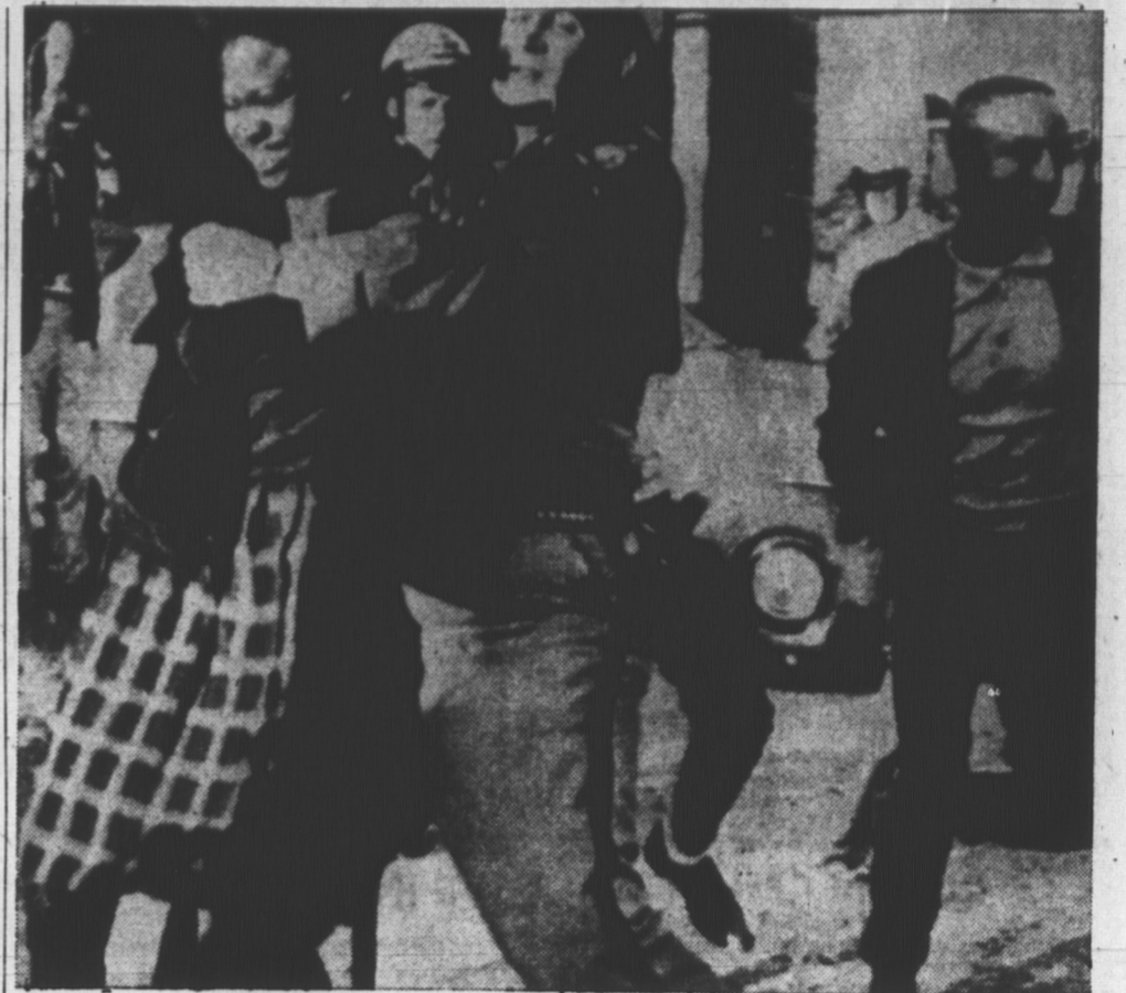
NEGROES DASH TO SCHOOL BUSES

The moon has no atmosphere to make braking easy, as on earth. The retro-rockets have to check the whole of the speed of the spaceship. Jodrell Bank estimated that in the case of Luna-7 this effect amounted to only one kilometre a second, causing the crash.