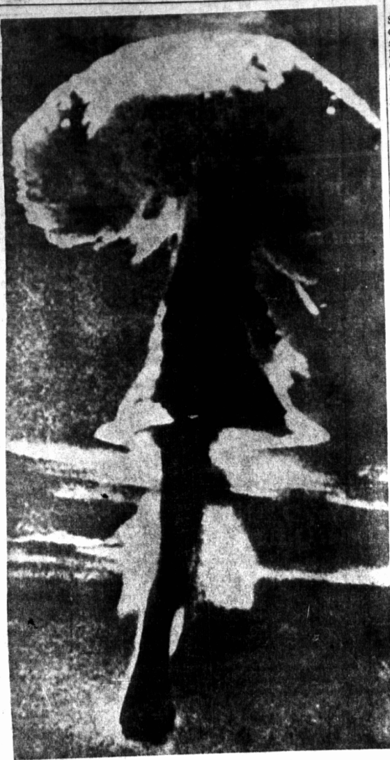
BRITAIN'S NUCLEAR BLAST

This is how Great Britain's third nuclear test explosion looked after it was dropped at high altitude in the central Pacific last Wednesday, thus concluding latest series of tests. It is a British official photo released in London.