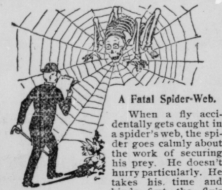
A Fatal Spider-Web.

She recoiled in anger and dismay too great for words. Who was this man who dared address her thus familiarly? What was this stranger who forced himself into these grounds to accost her? She raised her voice to call the servants to her assistance that they might