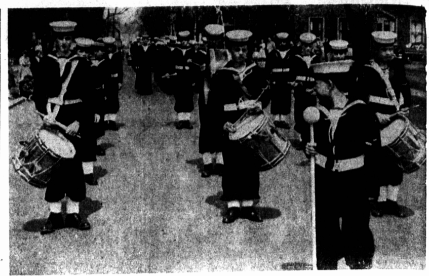
Members of the Royal Canadian Sea Cadet Corps Kent are seen above during a church parade yesterday. The occasion was the observance of Battle of the Atlantic Sunday.

The parade re-formed and on passing the war monument "saluted" in token of respect for the memory of the valiant dead.