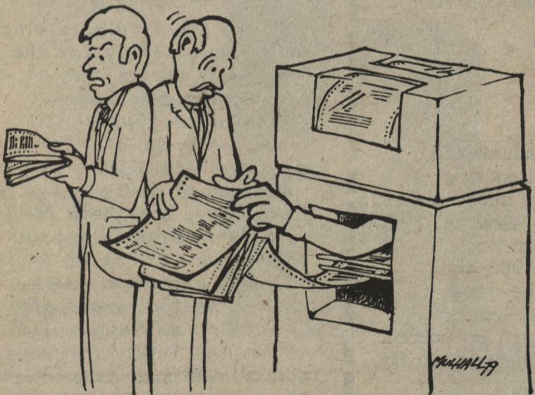
"You know sometimes I think the students are a lot deeper into the computer system than we think..."