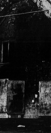
Woman dies in Apt. Fire