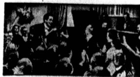
A guy so talented, that soon an entire nation was dancing - and making love - to "music by Duchin"!

A guy who reached up and shook the towers of Manhattan until they rained golden apples!