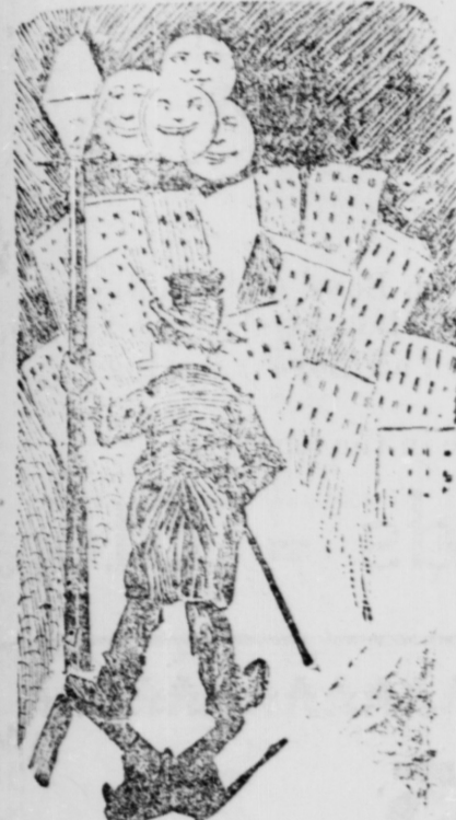
"THE WHIRL OF THE TOWN." —New York Journal.