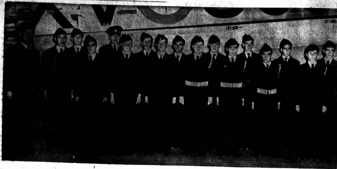
SUMMERSIDE AIR CADETS RECEIVE PROMOTIONS