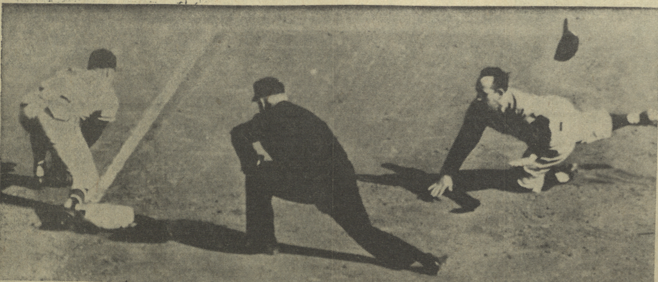
YOGI MAN MAKES A ONE-POINT LANDING

Mims cap, catcher Yogi Berra, in second inning World Series. New York Yankees, comes in to action. He is trying to reach third base with one knee down before Braves' third baseman Ed Mathews, catching throw from outfield, can swing around and tag him. He didn't make it.