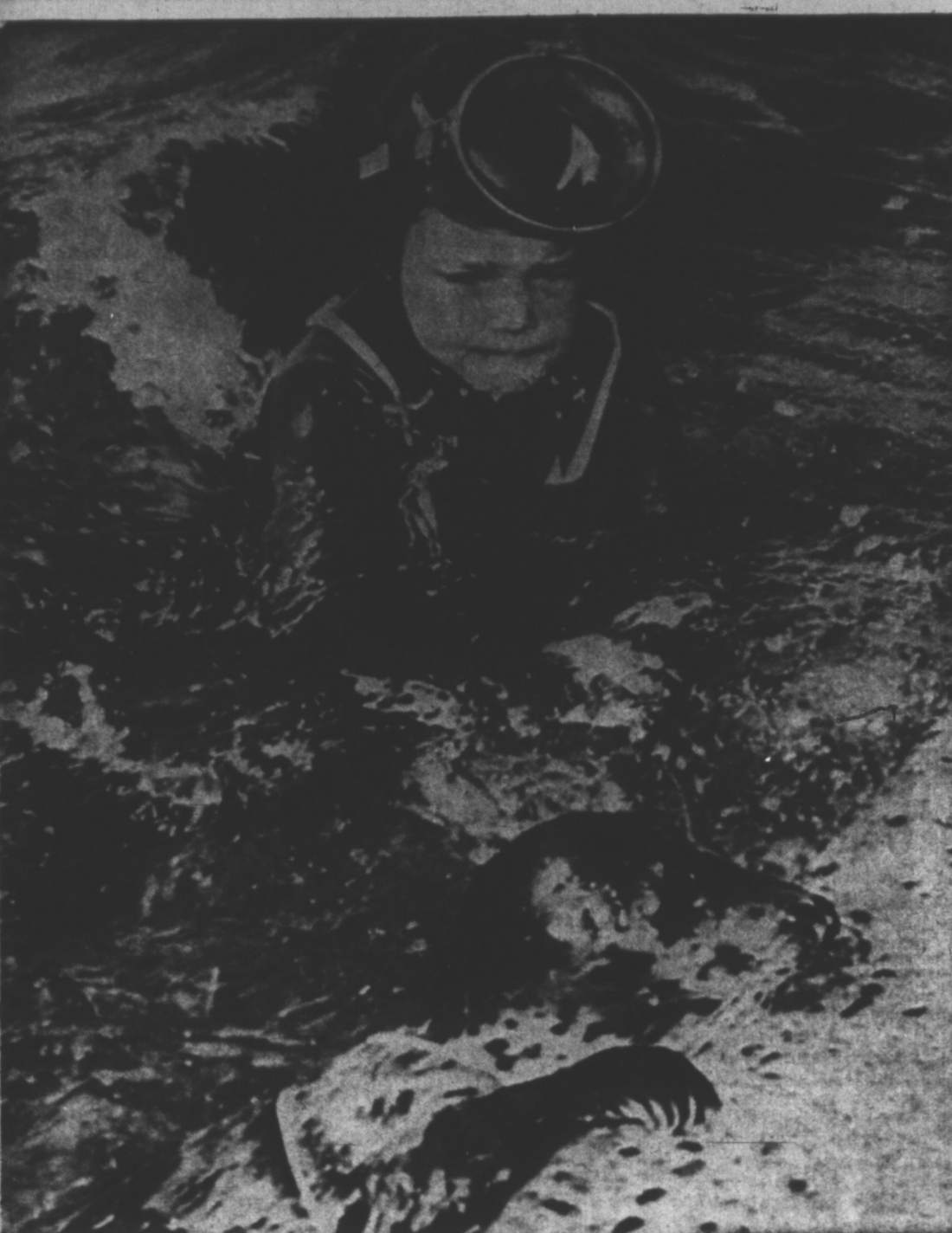
LEMME OUT OF HERE!

CECIL B. DEMILLE'S PRODUCTION THE TEN COMMANDMENTS A PARAMOUNT PICTURE IN VISTAVISION AND TECHNICOLOR. BOX OFFICE OPENS 6:45—SHOW AT DUSK 4 BIG DAYS — FIRST TIME AT POPULAR PRICES Adults 75c—Children under 12 yrs. 25c BRING THE WHOLE FAMILY TONIGHT ONLY—"The Man in The Grey Flannel Suit"