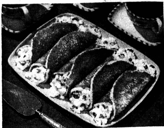
Prepare pancakes according to basic recipe. Spread each pancake with chopped creamed chicken. Roll up. Serve with hot cranberry sauce.