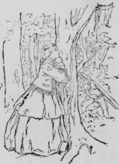
"What was Strong thinking of?"

Liza's fastidious taste was sorely outraged at home scores of times each day.