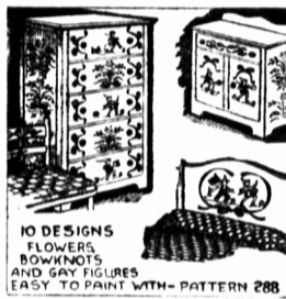
DESIGNS FOR A CHILD'S ROOM

CANADA'S FAVOURITE FAMILY TONIC ASK YOUR DRUGGIST FOR WAMPOLE'S EXTRACT TO-DAY! 15 ounces--$1.35