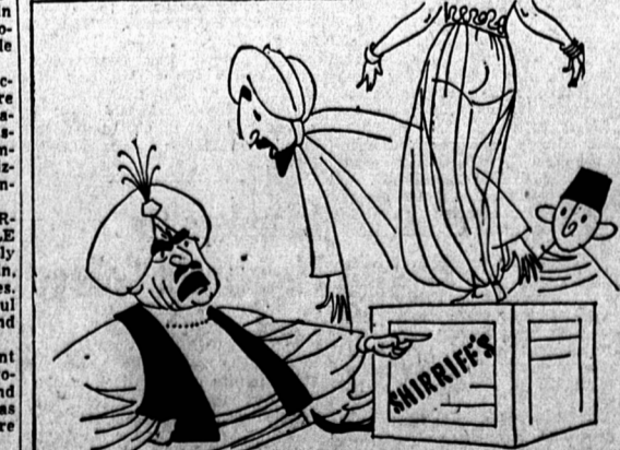
"No! No! I'm bidding on the case of Sherriff's Marmalade!"