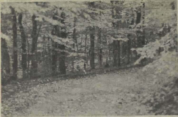
Math Department finally gets new Student Lounge. Seasonal Only.