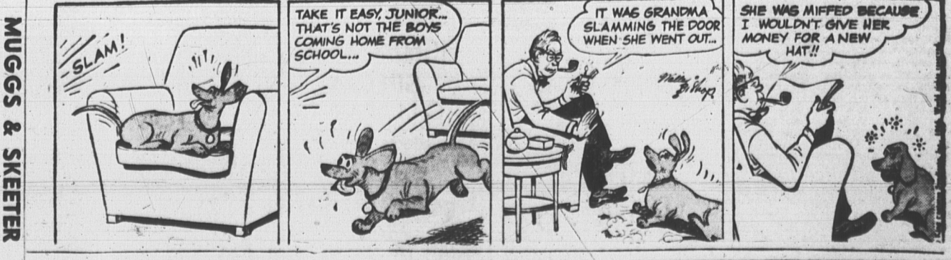
MUGGS & SKELTER