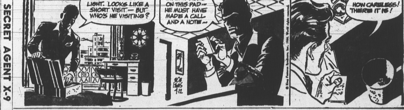
SECRET AGENT X-9