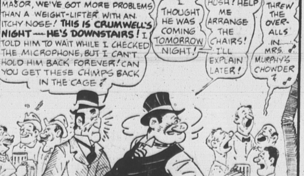
MAJOR, WE'VE GOT MORE PROBLEMS THAN A WEIGHT-LIFTER WITH AN ITCHY NOSE! THIS IS CRUMWELL'S NIGHT — HE'S DOWNSTAIRS! I TOLD HIM TO WAIT WHILE I CHECKED THE MICROPHONE, BUT I CAN'T HOLD HIM BACK FOREVER! CAN YOU GET THESE CHIMPS BACK IN THE CAGE?