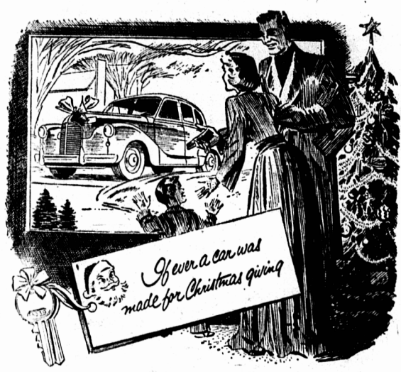
IT'S THE AUSTIN A-40 DEVON SEDAN

THIS CHRISTMAS give yourself and your family an AUSTIN—and you'll give them motoring pleasure for the years to come. With first cost and upkeep of an AUSTIN as low as it is, you can operate two cars at the former cost of one. One thing sure, whether as first car or second car, you'll fall in love with the smooth, quick way your AUSTIN performs.