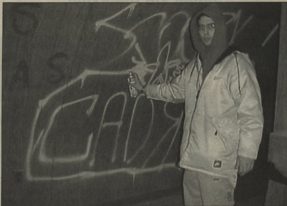
Since there's no trains in Char'town, I'm taggin' the fuckin' Barn.

Mechanicals or Windom Earle rock the house there, and I slamdanced and punched the ceiling during a few Flush shows. I even had the chance to hold a mic and spit some lyrics during a show Coolbreeze put on last summer. I shook my stankin' ass (sometimes completely on the solo tip) while Pip Skid, Buck 65, the Raskalz and Kardinal Official each rocked the mic at the Ranch ... I mean the Barn on different occasions. These were kick-ass times and they will remain among my fondest memories of UPEI. However, I still hate the fucking