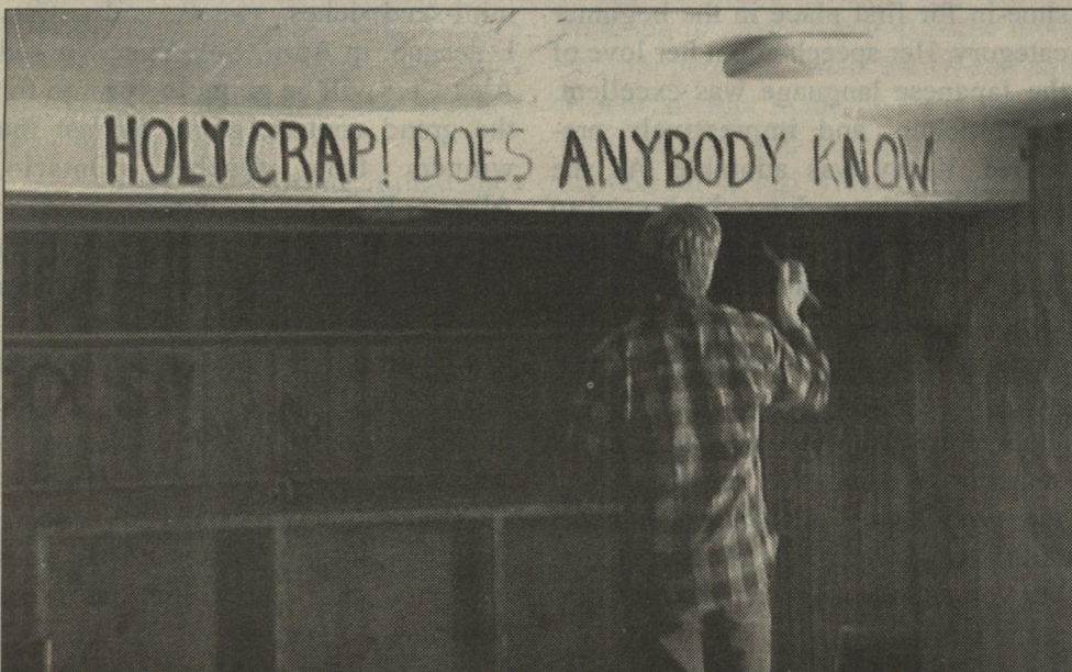
Holy Crap! Does T.Balls.Com have enough room to finish the sentence?

Most of the bar's patrons live on or very close to campus. It's too cold and expensive for them to travel downtown to dance. They have no choice but to go to Myron's, however, because the Barn plays almost exclusively shitty Top 40 music. Some people just can't groove to that. If the bar would play good dance, house, trip-hop, and hip-hop on certain nights, then they might be able to keep the place packed. Replacing The Barn with a new building is a good step, but now they have to work on keeping students happy with decent music.