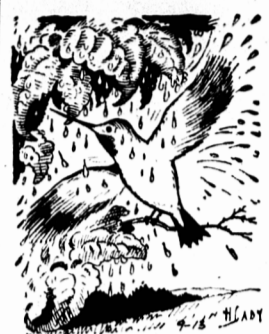
Smart Little Hummer takes her shower regularly.