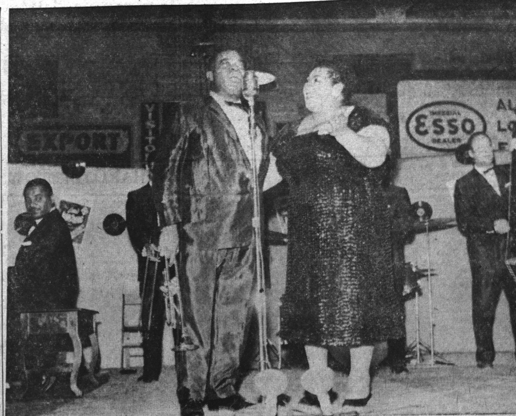
LOUIS ARMSTRONG and his vocalist, Velma Middleton, are seen at the mike as Satchmo vocalizing, gives out with some of his own.

High tide today at Charlottetown at 4.49 a.m. and 6.18 p.m. At Rustico at 12.28 a.m. and 12.42 p.m. Summerside tide about ten minutes later than Charlottetown. Sun rises today at 4.58 a.m. and sets at 7.43 p.m.