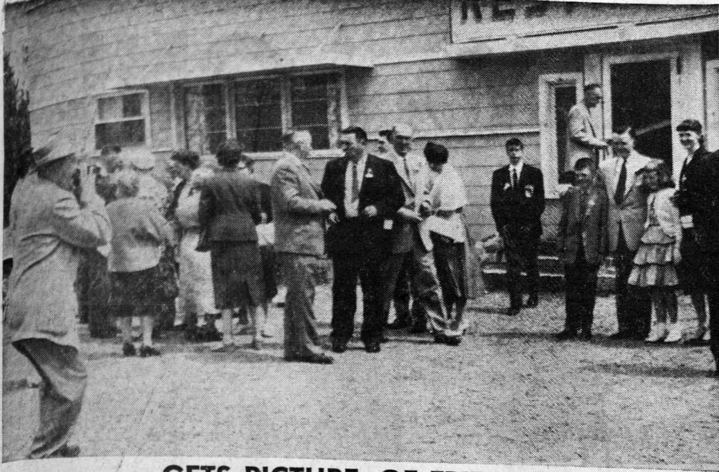
GETS PICTURE OF FRIENDS

A group of friends is photographed by one of the Chiefs of Police attending their 7th annual Maritime Association meeting in Summerside yesterday.