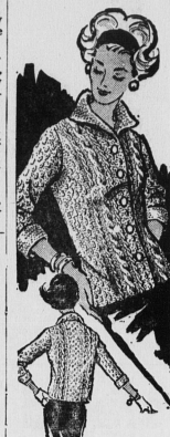
by Alice Brooks

TWO WAYS SMART Be different! Knit complete sweater in stockinette stitch or crocheted in daisies.