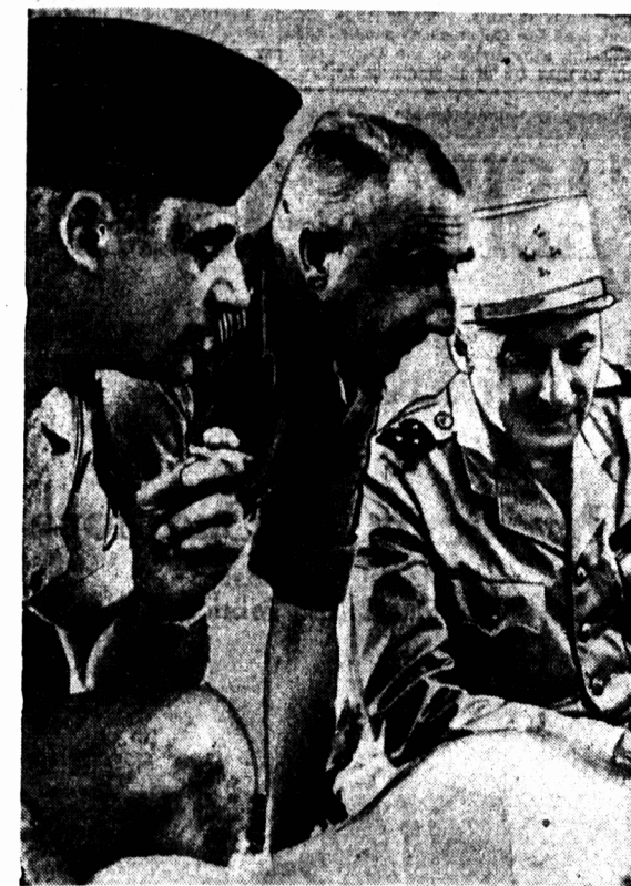
Commander of the French forces at Dien Bien Phu, Indo-China, Brig-Gen. Christian de Castries, centre, has issued an order to his troops to die rather than yield an inch. Communist troops advanced to within a few hundred yards of his headquarters in attacks that ignored casualties inflicted by machine-guns firing into masses of men at close range. The French hoped that air support would save the fort from capture but bad flying weather has kept planes grounded.