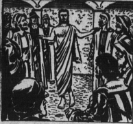
After the Crucifixion, Jesus appears to the Apostles, charging them as His missionaries throughout the Roman Empire.—Matthew 28:18-20, Acts 1:8.

Scripture—Matthew 28:18-20; Acts 1:8; 1:28-29, 35-38; Romans 1:13-16; 10:1-18.