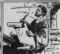
Paul writes his longing for the unbelieving Jews to know, accept and call upon Christ to be saved.—Romans 10:1-18.

MEMORY VERSE: —"But ye shall receive powers after that the Holy Ghost is come upon you: and ye shall be witnesses unto me both in Jerusalem, and in all Judea, and in Samaria, and unto the uttermost part of the earth."—Acts 1:8.