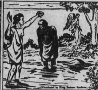
An angel turns Philip from city-wide evangelism to individual missionary work when he converts and baptizes an Ethiopian eunuch.—Acts 8:26-39, 35-38.