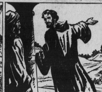
Paul expresses his desire to see the Roman Christians and his conviction that the Gospel he is preaching is God's power to save from sin.—Romans 1:8-16.