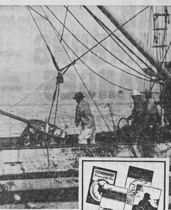
DEPARTMENT OF FISHERIES' publications are used by educational authorities across the country. Write to The Queen's Printer, Ottawa, for the booklets shown here. Available to the general public, 25¢ each.