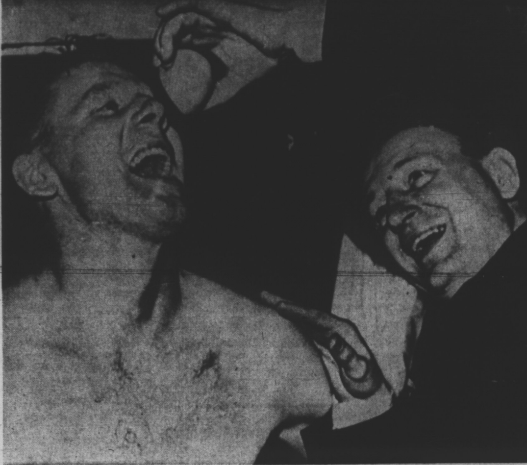
ROWER GETS ATTENTION Johnny Bower (left) Toronto Maple Leaf goalie has some orange juice squirted down his throat by coach George (Punch) Imlach in the dressing room after Leafs defeated Boston Bruins 3-2 to win the National Hockey League semi-final series. Leafs