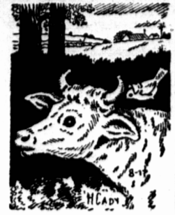
Just then a bird flew over and perched on the monster's back.