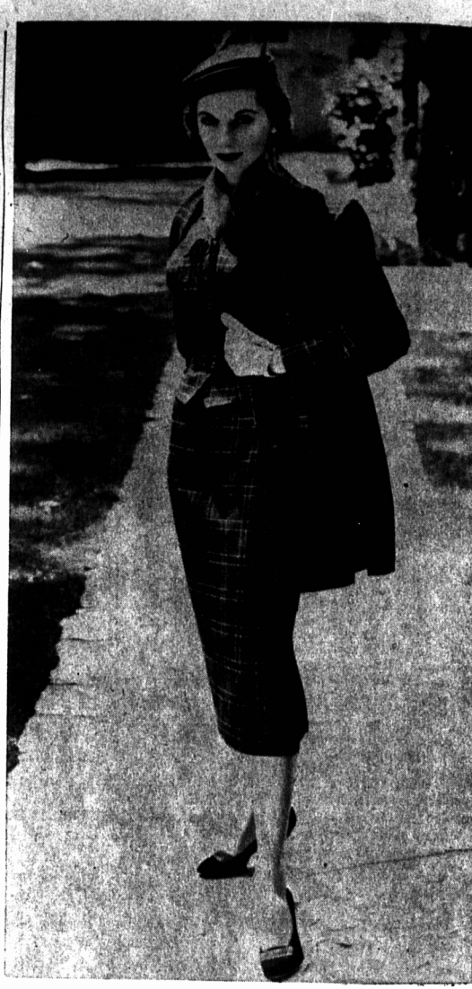
PLAID ENSEMBLE Worsted-wool flannel in tones of forest green and coral is featured in this plaid ensemble from California. It has a tunic-length coat with matching skirt and double-breasted weskit. The vest has a small cap sleeve and skirt has walking pleat in back.