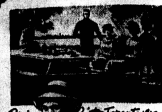
Penic - Bic Toronto 1912