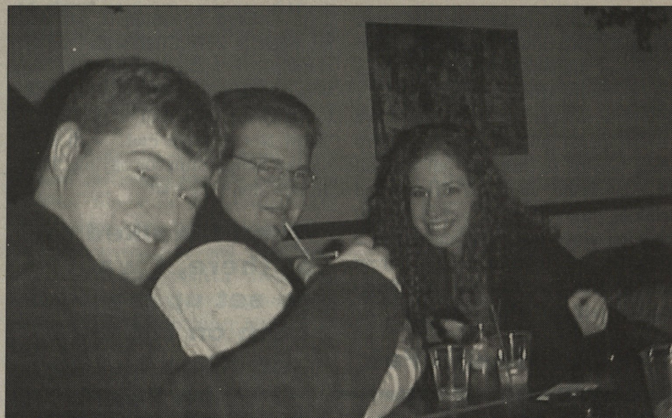
The pub crawl was a great success.

It really was fun: old people with guts and golf shirts know how to take their spectacles off at party time. They showed us how to do everything, including serenade your friends with hot music from the bronze age. They even dropped tips on how to score with tomatoes—whatever the hell that means: (1) get your fat wrinkly friend to sing a slow grating romantic song in the wrong key; (2) proceed to slow dance with the old lady, and slur to her over your beer gut; (3) do not crush her toes like last week and the one before; (4) slur to her—over your beer gut—you didn't step on her feet like last week . . . and the one before (5) pop a Viagra; (6) pop a . . . Oh yeah, no . . . Shit! Goddamn Viagra! Go home and sleep on the couch. Yeah, I