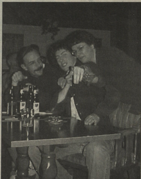
The author with his new friends from the Inn on the Hill.

After this we headed to Dooley's to shoot pool. After Dooley's we walked down to the Inn on the Hill. Wait, we walked up the hill to the Inn. This was my favorite spot. It had karaoke and old people. We met up with another pub crawl, the psychology pub crawl, and believe me, it got wild. People were getting up and singing. People were dancing, talking, yelling, drinking, and running to the washrooms.