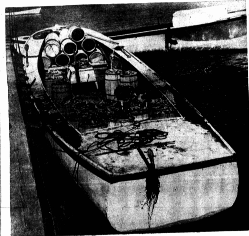
LANDING AN OYSTER CATCH FOR SEED