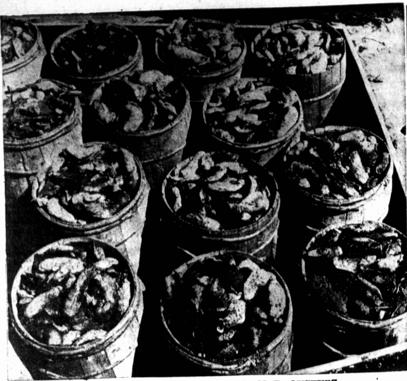
PROSPECTIVE PARENTS OF N. S., N. B. OYSTERS