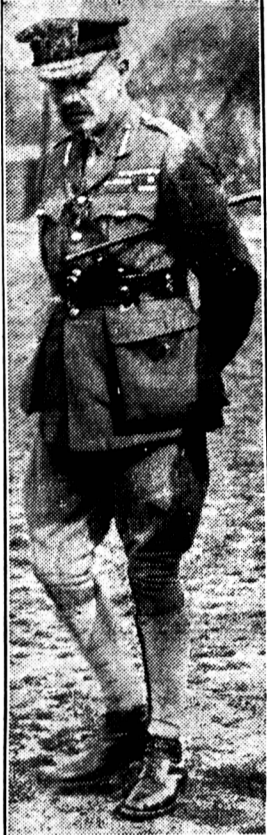
LIEUT.-GEN. SIR JULIAN BYNG, Commander of the Canadian Corps at Vimy Ridge. In recognition of the victory he later chose the title "Baron Byng of Vimy." He died in 1935.