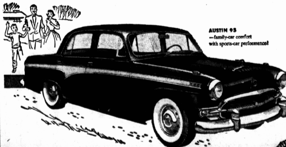
AUSTIN 95 —family-car comfort with sports-car performance!

AUSTIN—now backed by a free 12-month or 12,000-mile written factory warranty. Aren't these the driving features you want? Don't they say this is your year for AUSTIN? And isn't it time you looked into all the other AUSTIN features—the new styling, new safety, new luxury? Visit your AUSTIN showroom and get all the answers on AUSTIN TODAY!