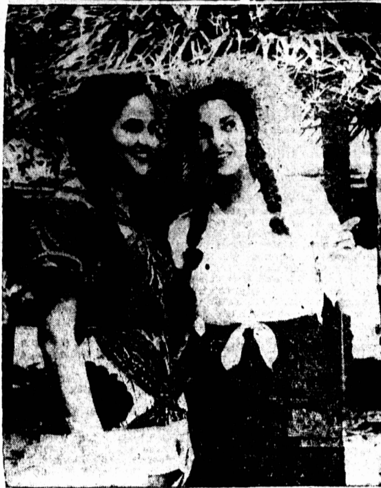
SURVIVE HURRICANE — Screen star Linda Darnell (right), on Jamaica in a movie-making chore, chats with Sheila Chong, a local girl with a part in the film. Both were in the path of the hurricane which battered the island, leaving more than 150 dead. The actress was reported safe after the storm passed the area.

Several farmers of the district have taken advantage of the bul-